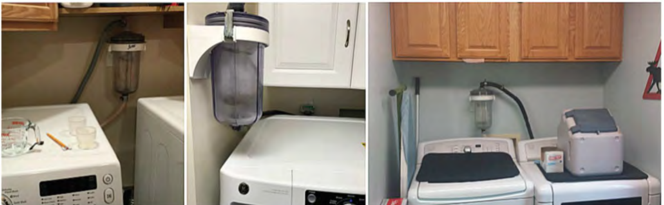
Examples of filter installments

If you think you qualify, please email us at info@gbf.org